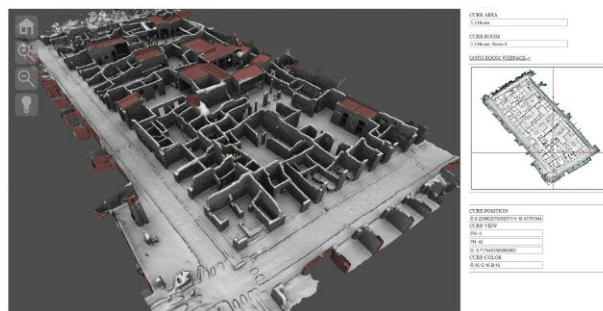
Figure3: Handling a large 3D mesh (about 20M triangles) in 3DHOP using the Nexus technology.

The evolution of 3DHOP will be focused on the integration of visualization components for other multimedia layers, like images, audio, video, etc. Work is already underway for the management of large 3D terrains and RTI (Reflectance Transformation Imaging) images [3].