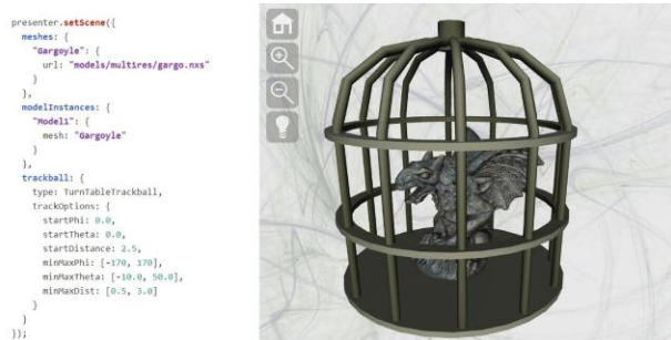
Figure2: Declarative programming in 3DHOP: the virtual scene is defined using different text fields, easily modified by the user with different values to build a similar small scene (fully textual approach).

and are mainly aimed at expert Computer Graphics (CG) developers.